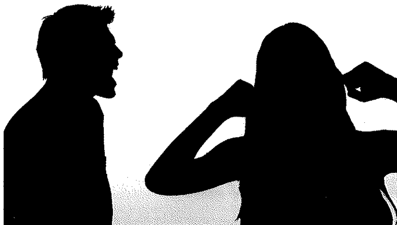
He told me he didn't love me, and that he never had. But I just wasn't buying it.

I said: "It's not age-appropriate to expect children to be concerned with their parents' happiness. Not unless you want to create co-dependents who'll spend their lives in bad relationships and therapy. There are times in every relationship when the parties involved need a break. What can we do to give you the distance you need, without hurting the family?"